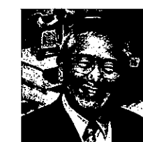
Purdue University Distinguished Professor Mr. Ei-ichi Negishi (Teijin Group Distinguished Fellow) 5th year Teijin Kumura scholarship (1957)

*This message was contributed in November 2013.