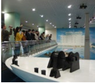
Technical Visit to Shanghai Yangshan Deep Water Port