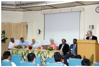
The Opening Ceremony

19:00 - 21:30 Dinner at Sparkling Sand (Beach Guest House)