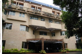
The IC&SR Building