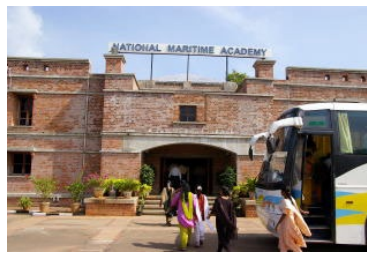
The National Institute of Port Management