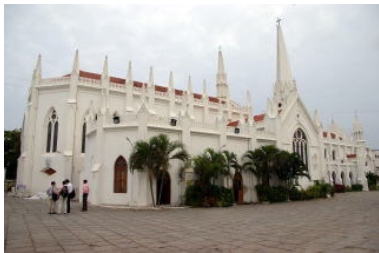
The Sao Tome Church