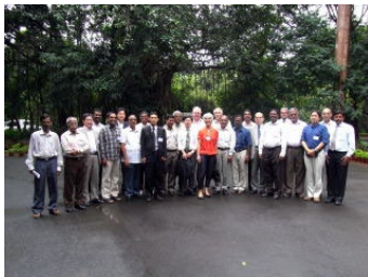
After the Valedictory Function