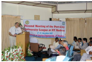
The Technical Session