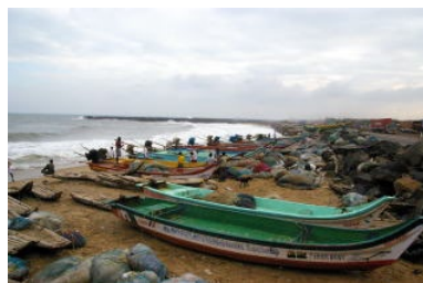
The Chennai Coastline