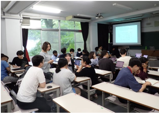
The second themed lecture

mechatronics, and AI in promoting circular economy and smart cities.