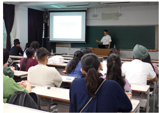
Lecture on Japanese culture