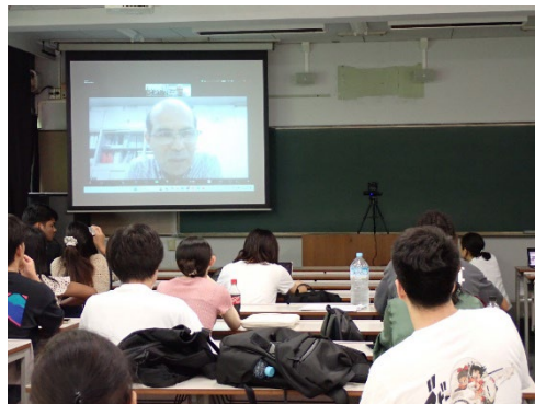
The third themed lecture