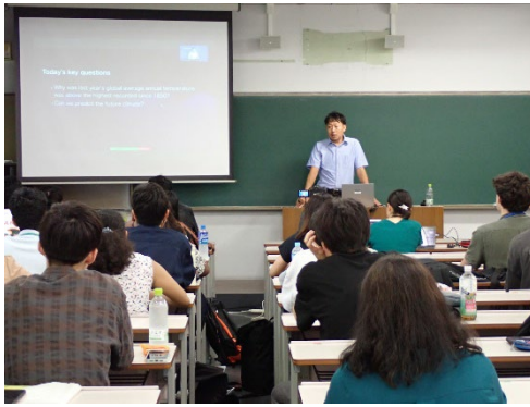
The first themed lecture