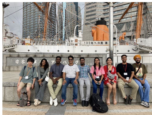
Yokohama Port Museum